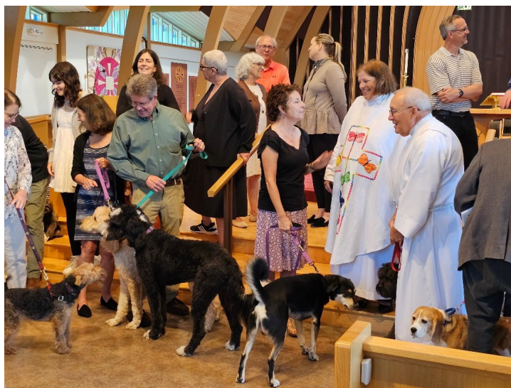
Pets and their humans enjoyed the Pet Blessing on Oct. 6