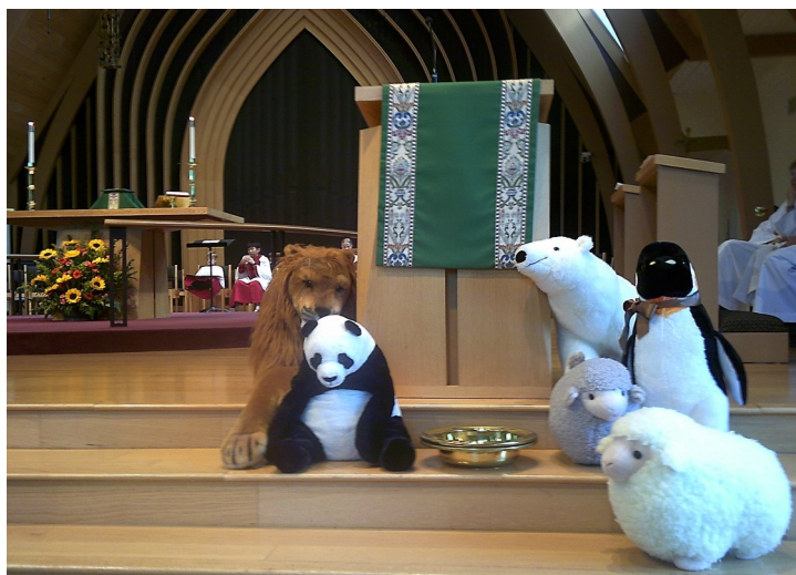
Pastor Vicki's collection joined the Pet Blessing on Oct. 6