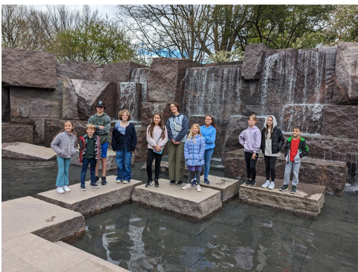
Members of Saint Mark's Canterbury Choir at the FDR Memorial during their pilgrimage to Washington DC April 5-7. The choir also toured areas around The Mall and Washington National Cathedral.