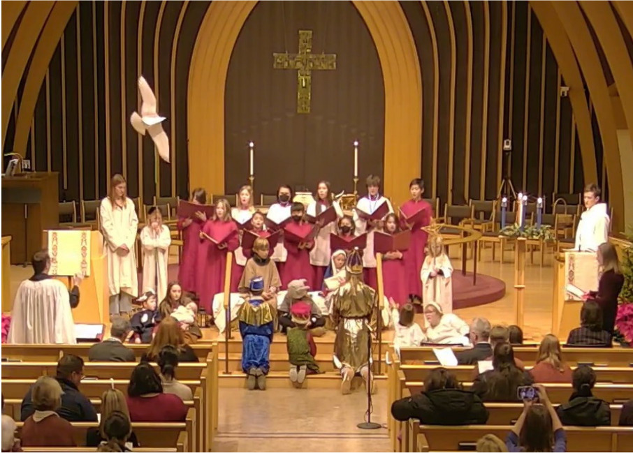
Saint Mark's Canterbury Choir and children of Church School perform the 2023 Christmas Pageant.