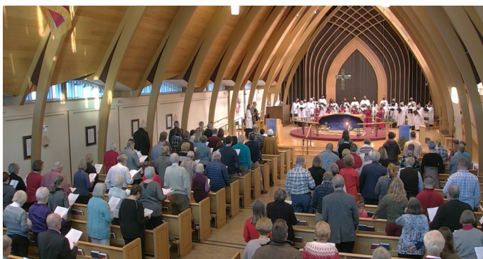
Over 180 were in attendance at Saint Marks' Festival of Lessons and Carols