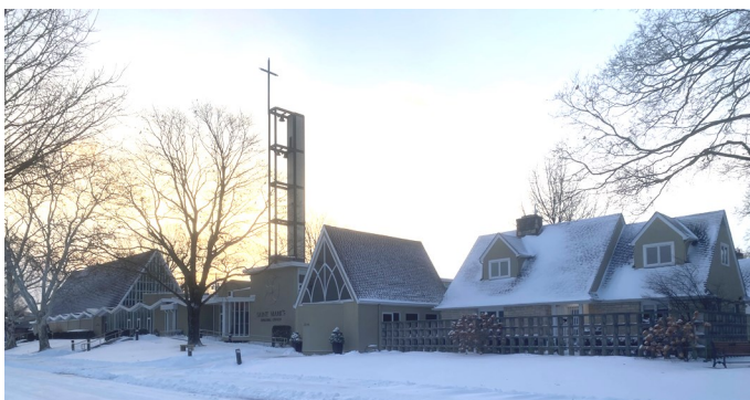
All is Calm. All is Bright. And very cold this Christmas in Columbus.