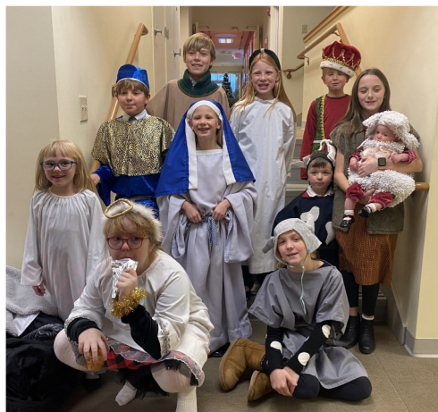
Children gather minutes before the pageant for a last minute photo op.