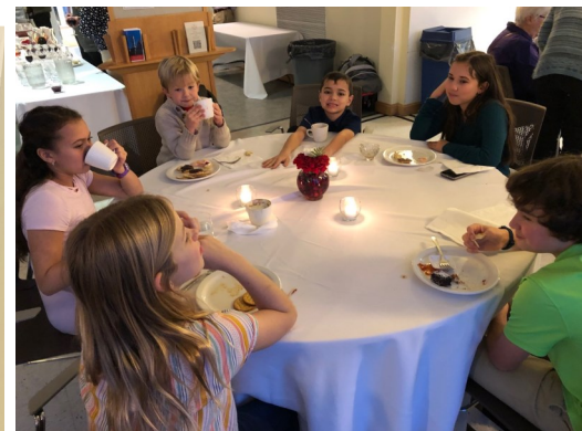
Canterbury Choir choristers enjoy hors d'oeuvres, hot chocolate, and each others' company at the reception following their performance at Lessons and Carols.