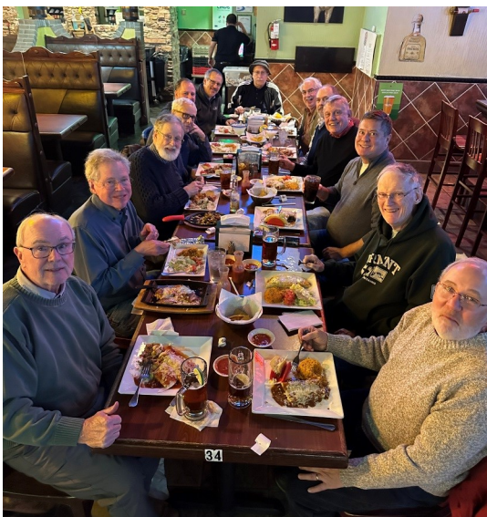
The Marksmen enjoy dinner at Don Tequila restaurant in Upper Arlington on Wednesday, Jan.25, 2023.