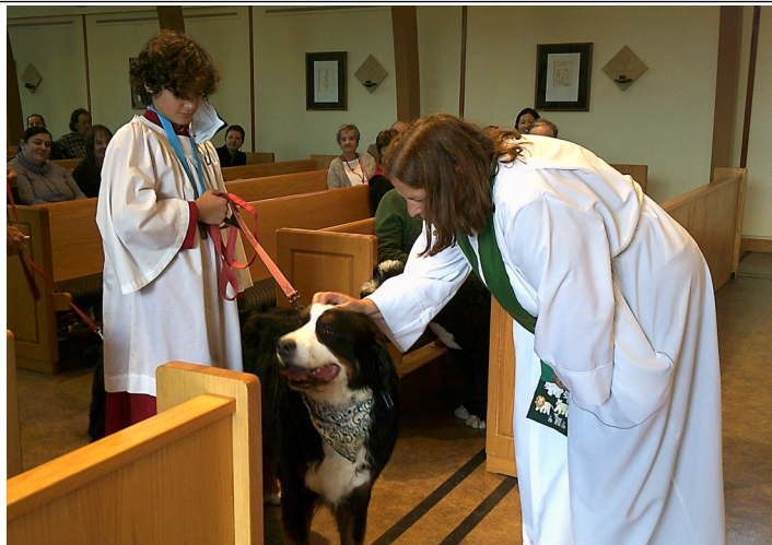
A day for blessing our furry family members in celebration of St. Francis of Assisi and all God's animal kingdom..

we are looking for a few people to take pictures during coffee hour in November and December. If you are in-