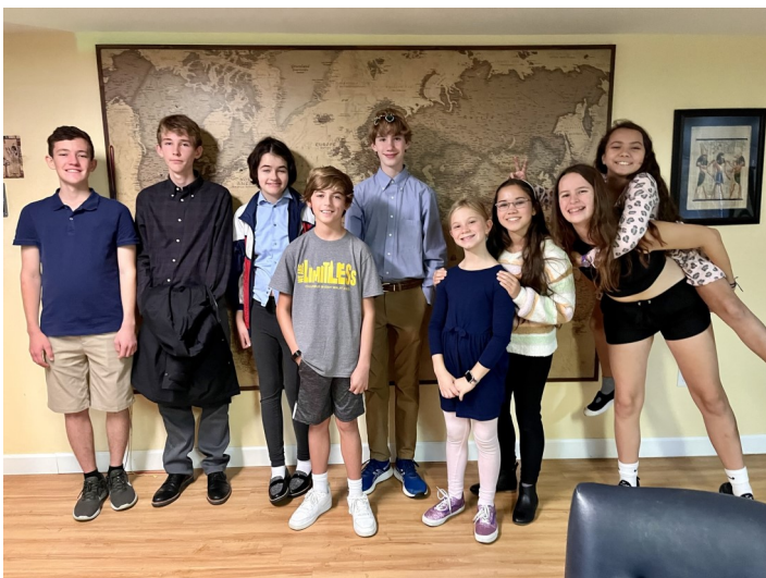
Members of Youth Group work together to solve the Escape Room puzzle at a recent outing at Escape It in Grandview.