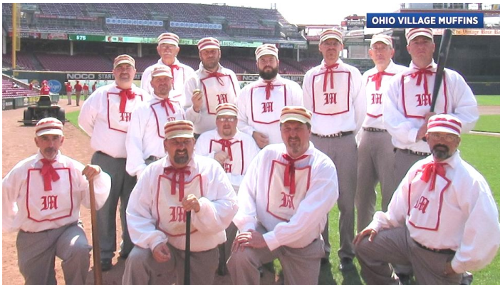
Ohio Village Muffins.

Saint Mark's Day: Ohio Village Muffins vs. German Village 9 – Aug. 20